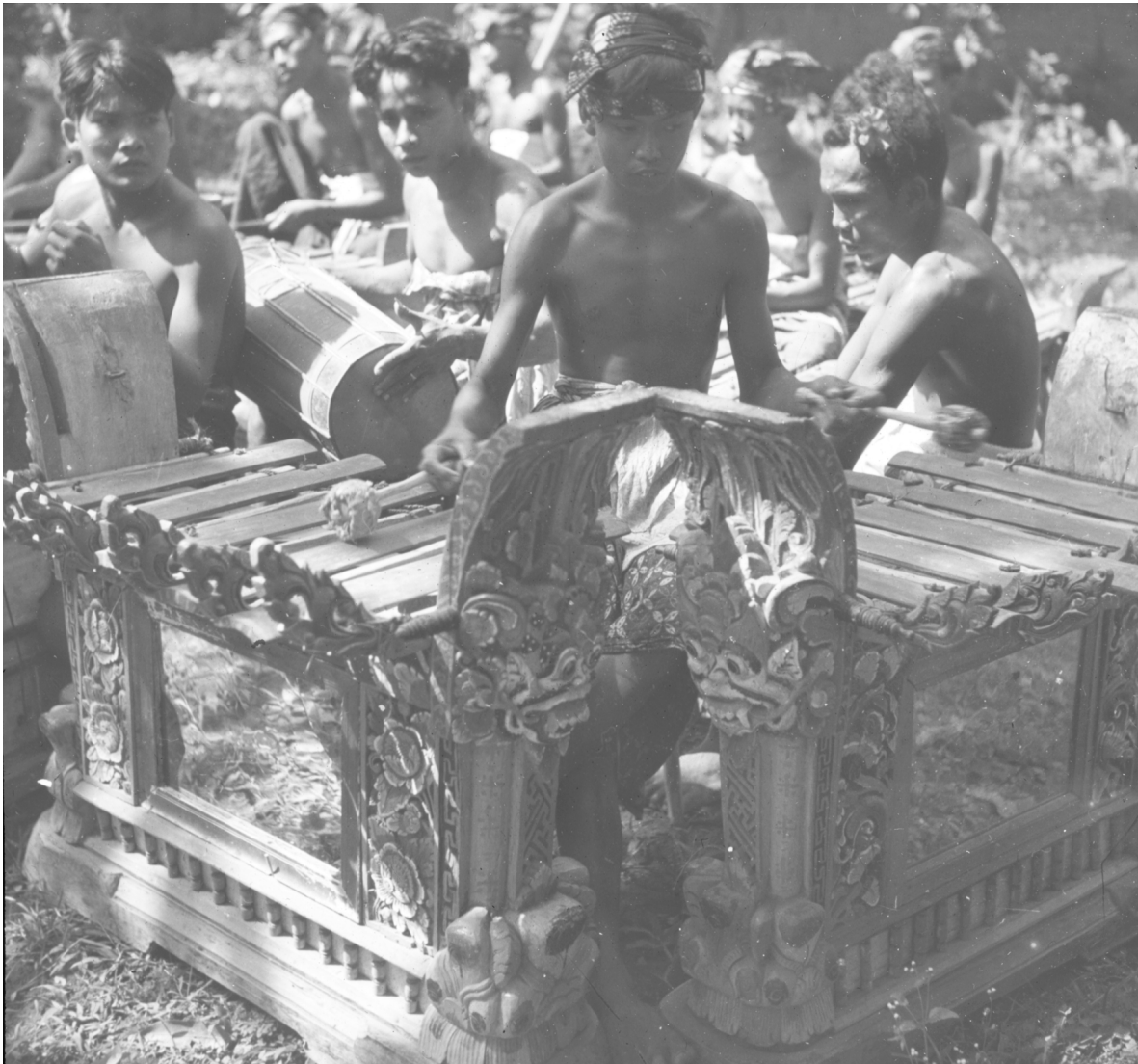
Jégogan in gamelan pajogédan of Sayan Photo by Colin McPhee circa 1931–38 Courtesy of UCLA Ethnomusicology Archive & Colin McPhee Estate