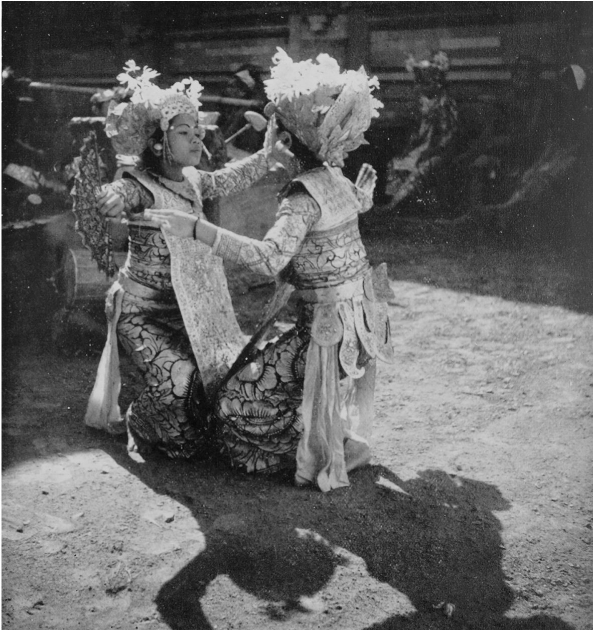
Légong at Bedulu: pangipuk (love dance)