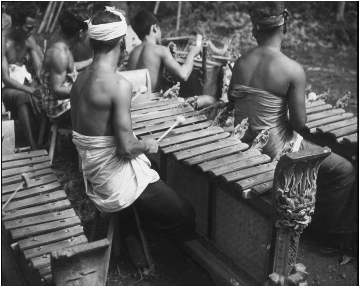
Rindik pangugal & rindik barangan (on left) in gamelan pajogédan of Sayan