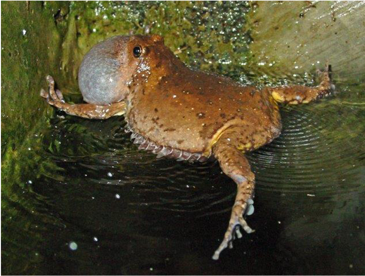
Enggung ‘ Kaloula Baleata ’ expanding his air sac to prepare a croak