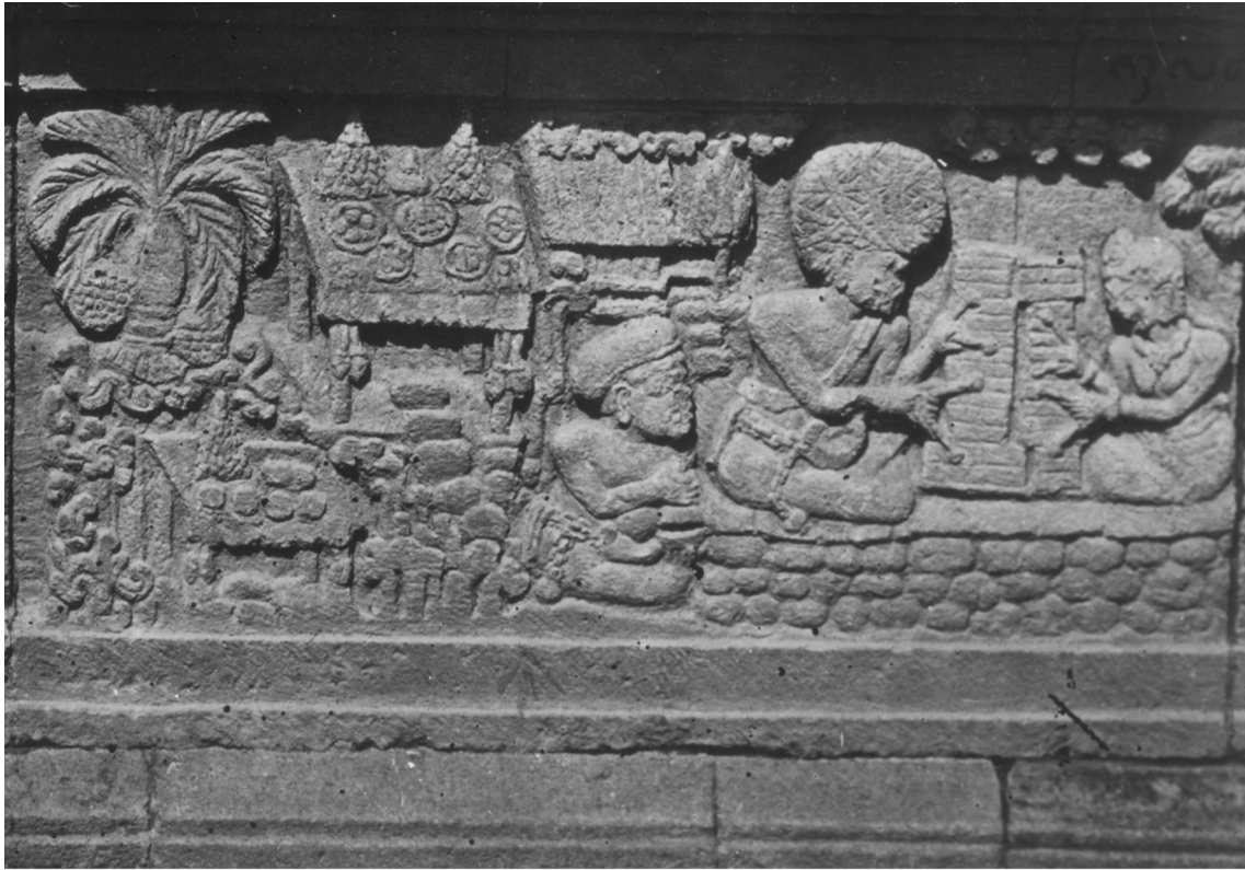
Gambang at Candi Penataran, East Java (Stone relief showing gambang players with two-pronged mallets, circa 12 th -15 th century) circa 1931–38