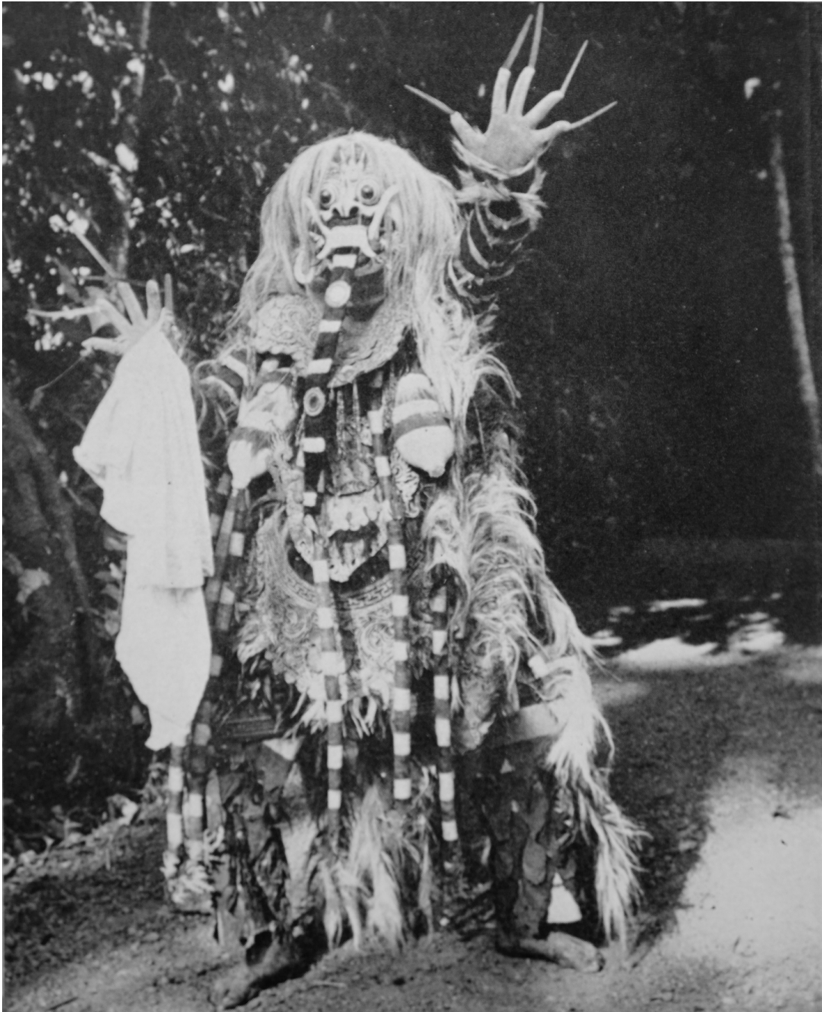
Rangda as a manifestation of the witch Calonarang circa 1931-38