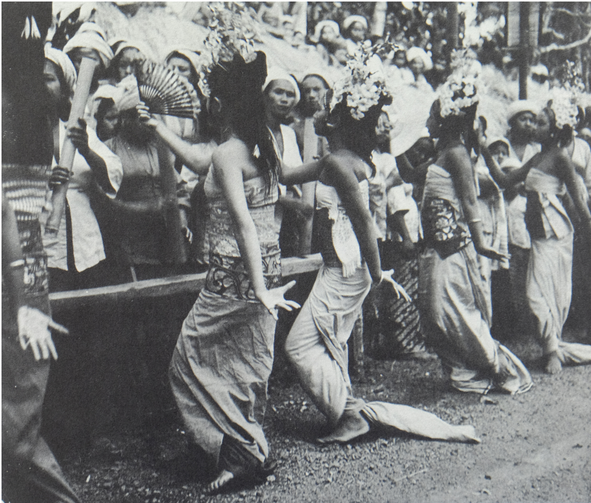
Jogéd Bungbung Déwa dancers during Nangkluk Mrana ritual at Pura Bada, Tabanan