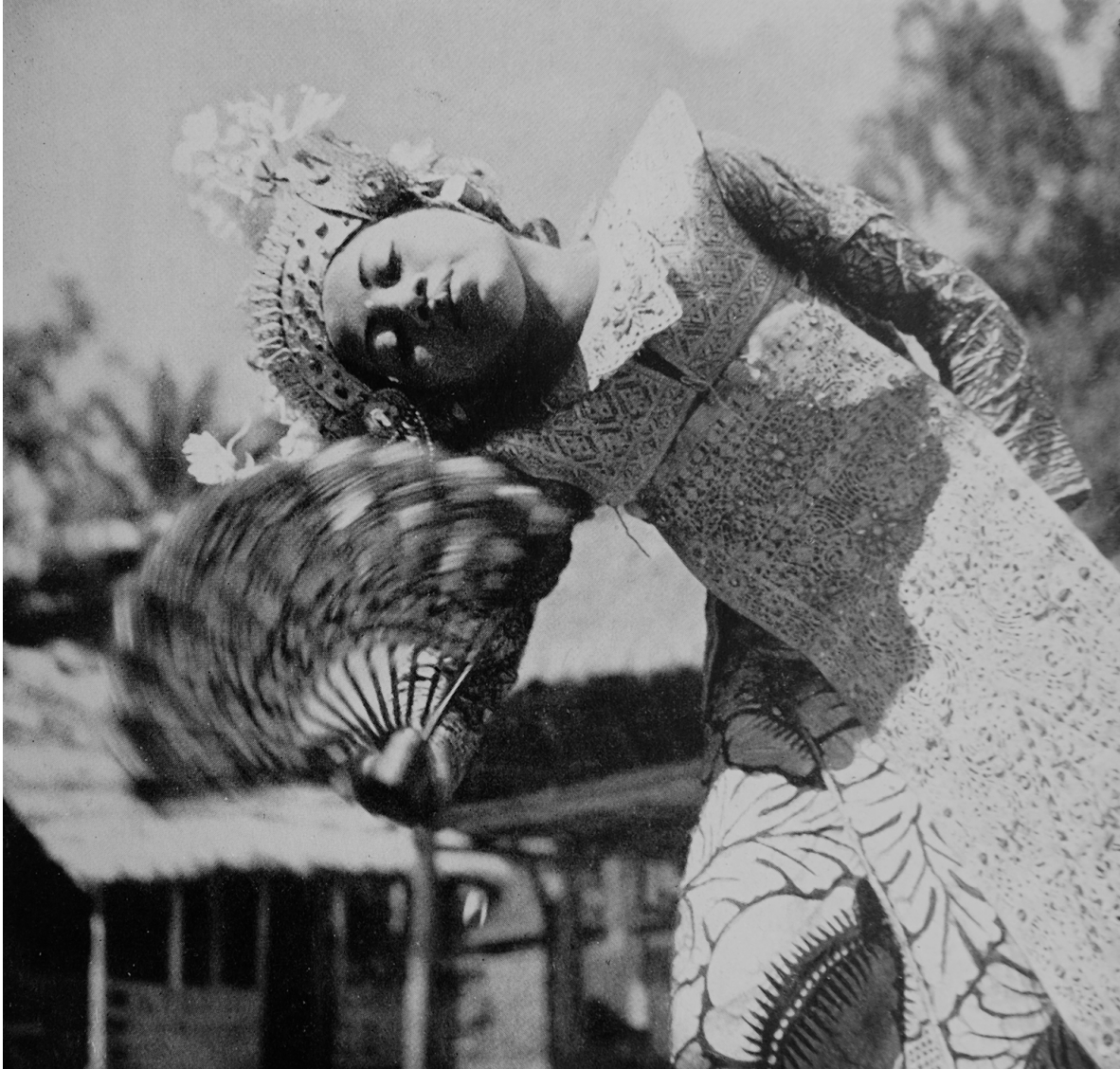
Légong at Bedulu