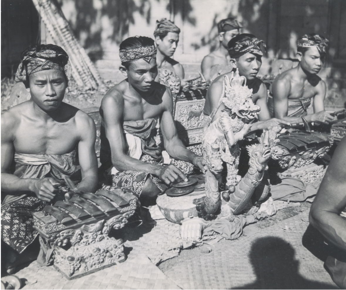
Gamelan palégongan of Kapal: gangs a pacek and céngcéng