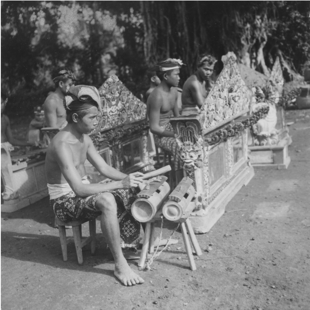
Bamboo kempli in the gamelan pajogédan Sayan circa 1931-38